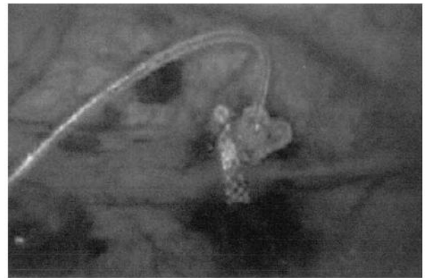
Figure 2. Pacing lead secured around phrenic nerve.

Phrenic nerve pacing can improve quality of life in quadriplegic patients and in patients with primary alveolar hypoventilation by eliminating the dependence on a ventilator. In patients with per-