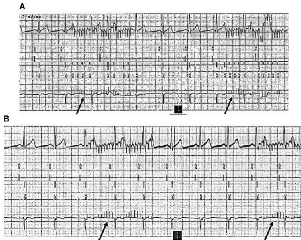
Figure 2. (A and B) Top line shows the surface ECG, middle-line marker annotations of the cardiac pacemaker (AP = atrial pacing; AS = atrial sensed event; VP = ventricular pacing; VR = ventricular event within refractory period; VS = ventricular sensed event), and the bottom line the bipolar ventricular electrogram. On panel 2a, the ventricular sensitivity of the pacemaker is set at 1.0 mV and pacing artifacts (arrows) of the diaphragm pacemaker are sensed by the cardiac pacemaker (see annotations in marker channel). After reducing the ventricular sensitivity (Panel 2b), the pacing artifacts of the diaphragm pacemaker are no longer sensed by the cardiac pacemaker.

cardiac pacing due to bradyarrhythmias. Cardiac pacing in the presence of a unipolar diaphragm pacing system is feasible and safe if thorough testing for possible interdevice interactions is performed. However, the experience gained from this patient is not transferable to the implantation of other cardiac pacing systems, such as implantable cardioverter defibrillators, because the sensing behavior is significantly different in these devices.